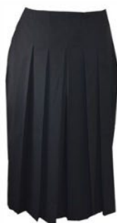
Girls (Junior & Senior) skirt