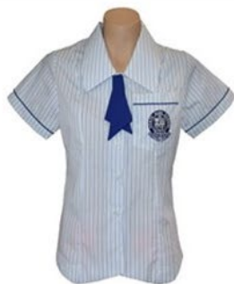
Junior girls shirt

All shirts are worn with the official school tie.