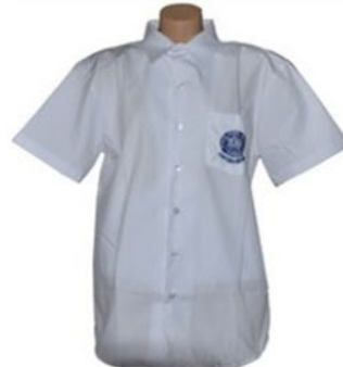
Senior boys shirt