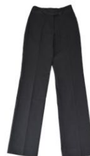
Girls (Junior & Senior) trousers