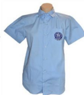
Junior boys shirt