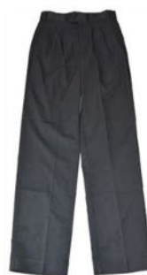
Boys (Junior & Senior) trousers