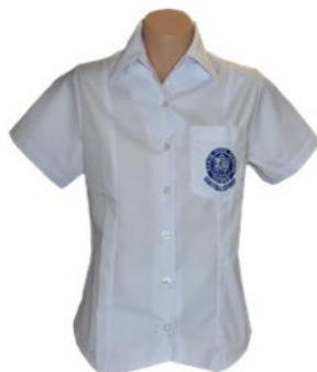
Senior girls shirt